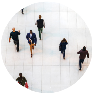
Visitor counts and gender statistics

The cloud-based dashboard gathers visitor data from Xovis sensors with options to expand analytics based on three modules. You can now implement software that's easy to use with state-of-the-art Xovis hardware.