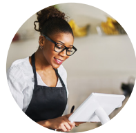
Integrated POS data